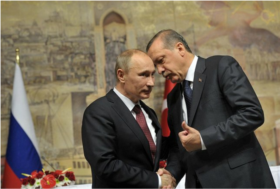
Putin headed to Erdoğan on 3 December 2012.

from taking any part in the battle for Kobani, which continued for months in the gun-sights of Turkish army deployed along the border. This ‘neutrality’ towards the ISIS brutal attacks triggered a wave of violent Kurdish protests inside Turkey, so that the ceasefire with the PKK (established in spring 2013) was broken by Turkish air strikes in mid-October 2014.