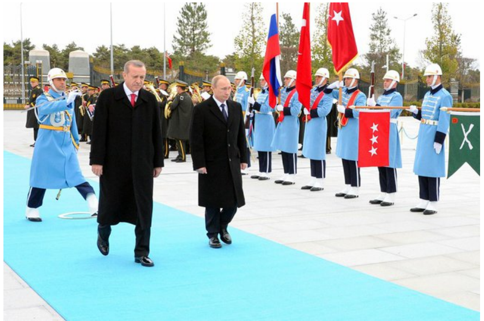
Putin arriving in Ankara on 1 December 2014.

Turkey was generally more positive than Russia towards the turmoil of the 'Arab Spring' focusing particularly on the revolutionary changes in Egypt. The military coup in July 2013 was a serious setback to Erdoğan's embrace of the Muslim Brotherhood cause, particularly as it coincided with the wave of public protests inside Turkey (spearheaded by the Occupy Gezi Park movement). Putin, to the contrary, supported the enforcement of